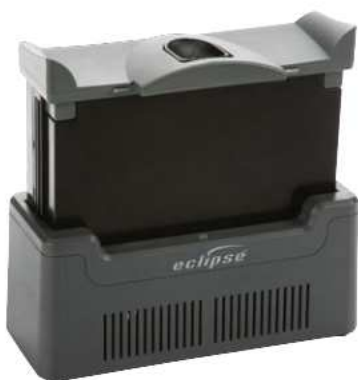
Desktop Charger PN #7112